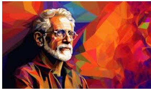
Figure 1: Image created with Midjourney, with the prompt: “portrait of a man with glasses, white beard and white hair, against a colourful, abstract background (Midjourney, 2024).

Example of an AI-generated image cited as a figure: